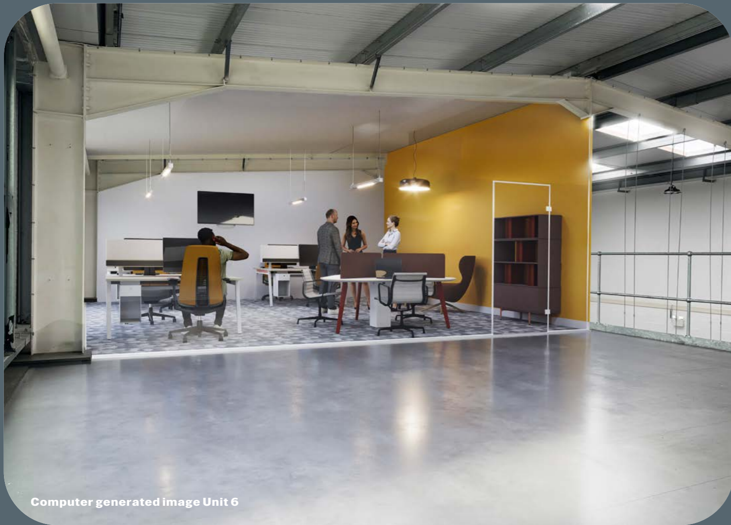
Computer generated image Unit 6